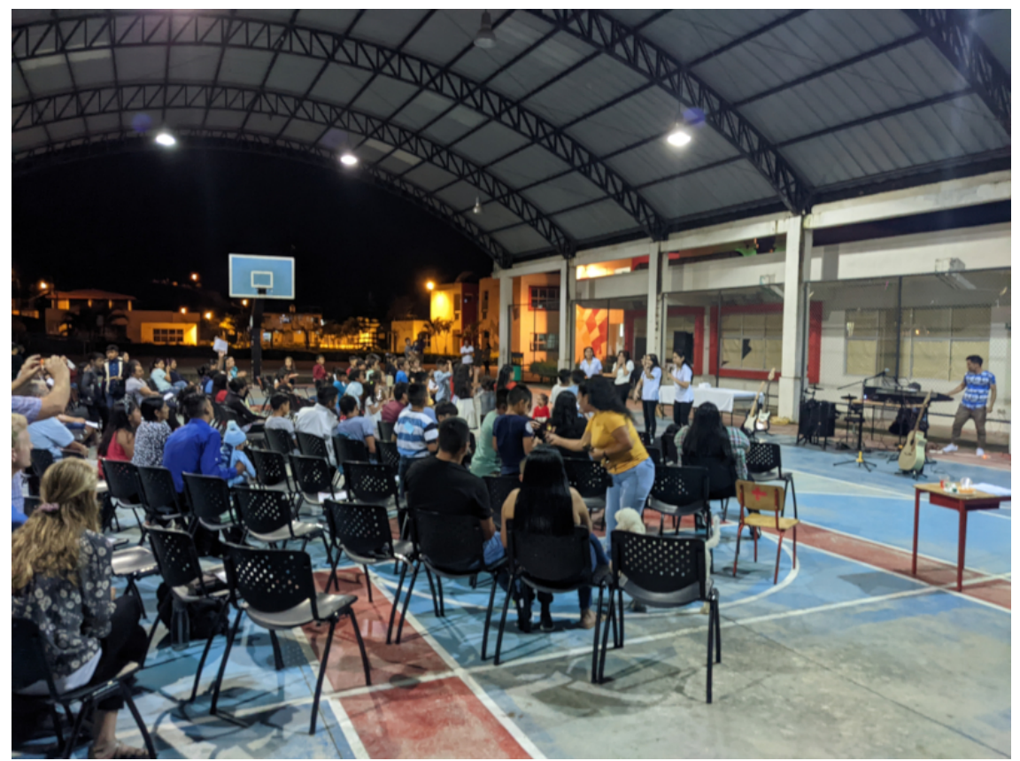
English Camp Graduation Ceremony