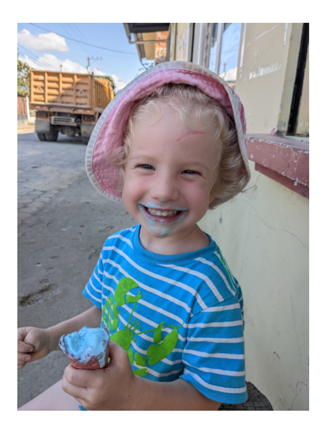
Nothing like ice cream on these 90 degree days we've been having recently