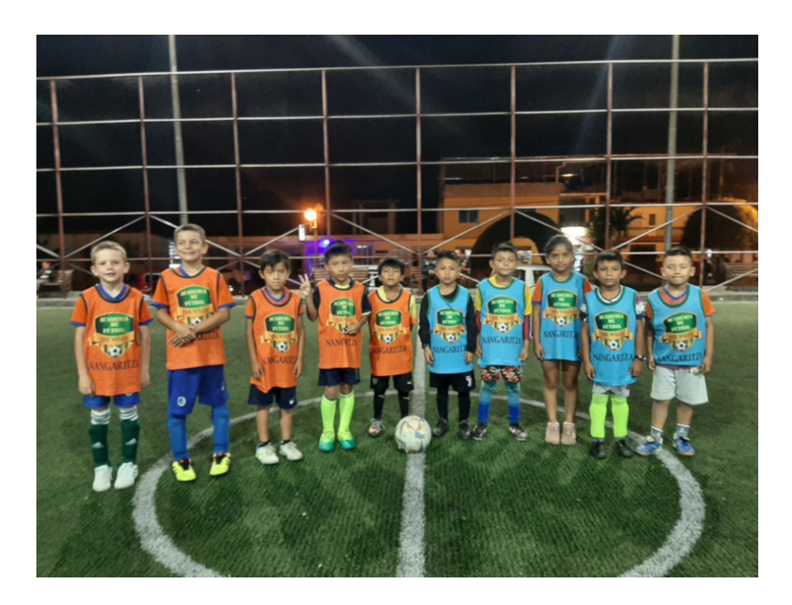
A recent soccer tournament